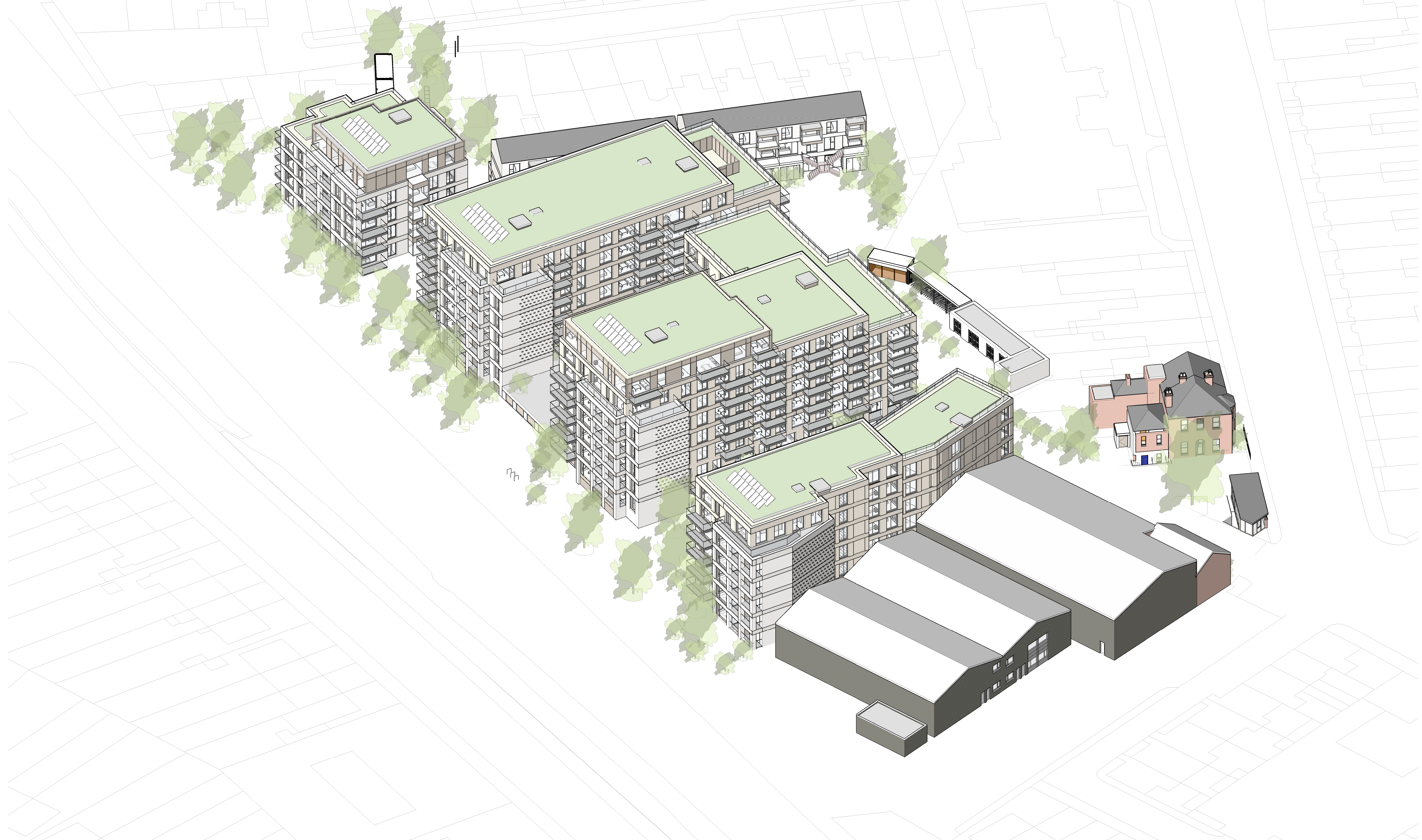
Axial View - South East